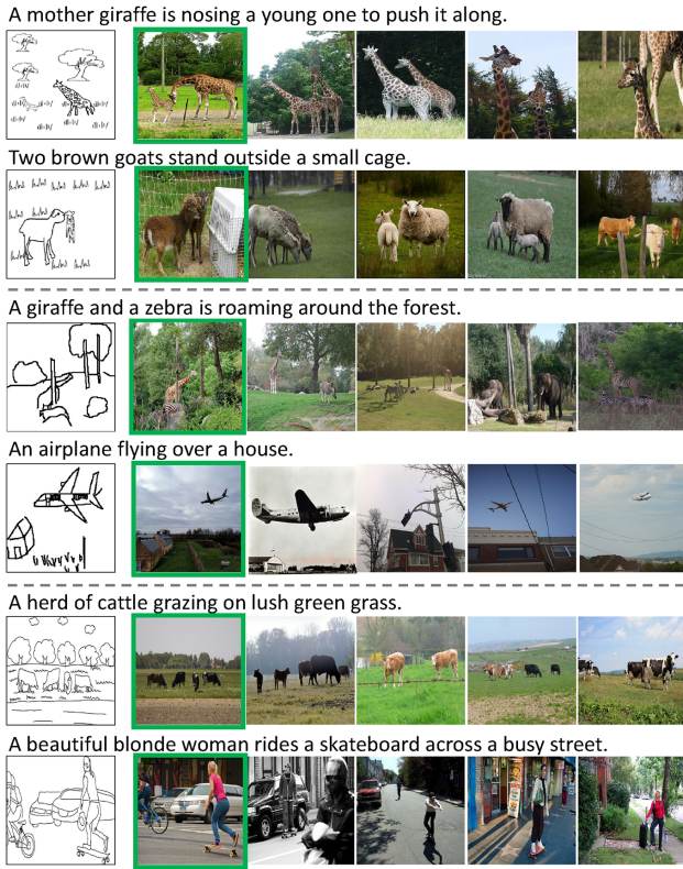
Figure 3: Top-5 retrieval results of SceneDiff on the SketchyCOCO, FS-COCO, and SFSD datasets. The true matches are highlighted with green rectangles.

enhancement module (GFEM) is added to improve the robustness and representativeness of the generated latent fusion features. (5) Baseline+Diff.+Channel-Att. : the channel-attention (Channel-Att.) is used to augment the representation consistency of generated latent fusion features and latent image features before contrastive learning. (6) Full Model : we assemble the complete retrieval model by integrating all modules, collectively improving the model’s retrieval performance. As presented in Table 2, each component contributes to the retrieval accuracy improvement. Direct integration of the pre-trained SD model proves suboptimal for the retrieval framework. CAFT, GFEM, and Channel-Att. are introduced to enhance its performance, with CAFT demonstrating the most significant impact. The best retrieval performance is achieved through the combination of these components.